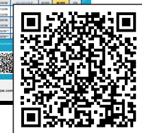
Interpack Case Sealers Promo

©2026 IPG • What's Trending at IPG - QR codes • 031026