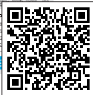
Gear Up Program