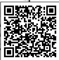
iTrack Sell Sheet