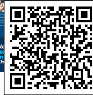
Packaging Diagnostics Flyer