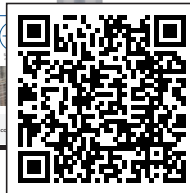
StretchFLEX PCR Sell Sheet