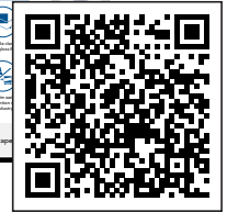
G7 Sell Sheet