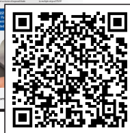
WAT & Better Packages Dispensers Program