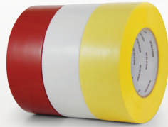
PE7 POLYETHYLENE TAPE