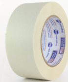
PM/513 MASKING TAPE