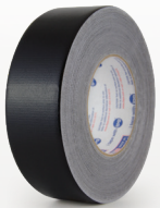
IRON GRIP AC617 DUCT TAPE