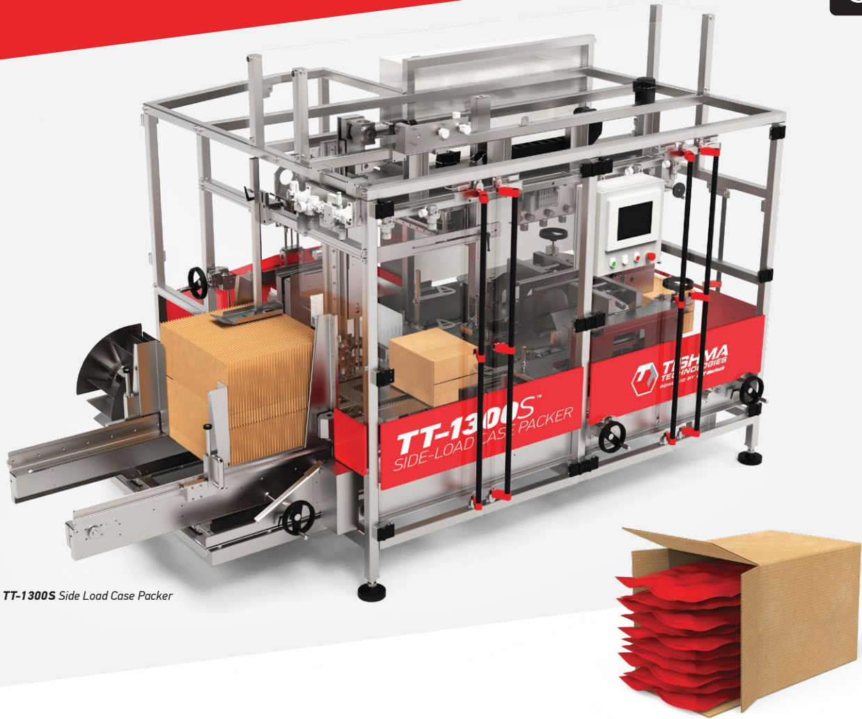
TT-1300S Side Load Case Packer