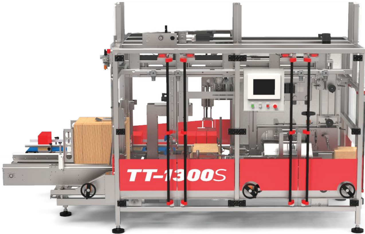
SIDE VIEW Tray Side-Load Case Packer