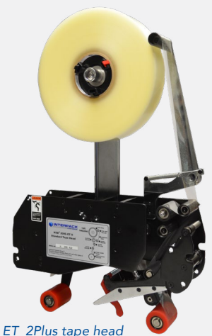
ET 2Plus tape head

When you compare features, benefits and value, Interpack Case Sealers are the right choice for operators, plant engineers, maintenance and purchasing.