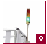
9 Standard low/no tape and water sensing to alert operators when to refill