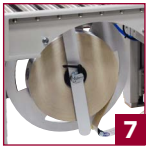
7 Easy bottom roll change