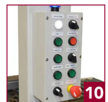
10 Manual & automatic controls with easy jam clearing