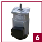
6 1/3 HP motors allow up to 85lb case processing