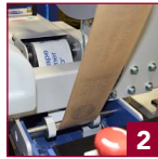
2 Powered tape unwind