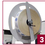
3 Large tape roll up to 4,500'