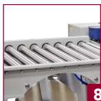
8 Powered exit conveyor to ensure even small cases exit completely