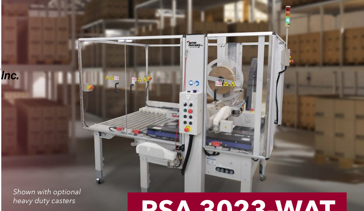
Shown with optional heavy duty casters