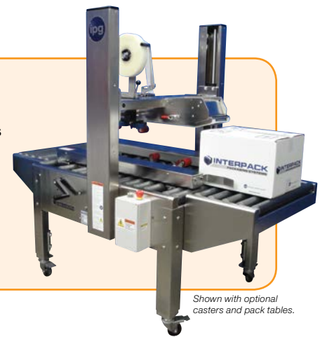
Shown with optional casters and pack tables.