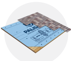
Engineered Coated Products